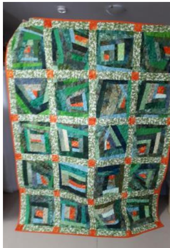
Slab blocks sewn by Val Ashborne