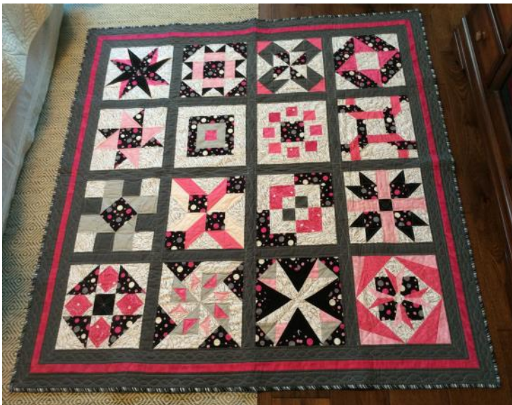
Left: Over half of the blocks are from The Bag Ladies Round About last year Right: I Spy Quilt made from the 5" kids' theme exchange blocks from 17-18.