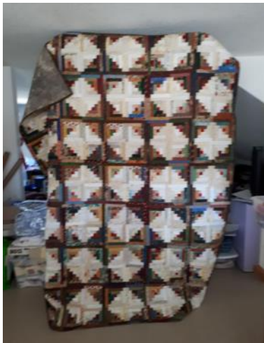
Log Cabin with hand bound binding