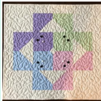
Cathedral Windows with Leah Mitchell.