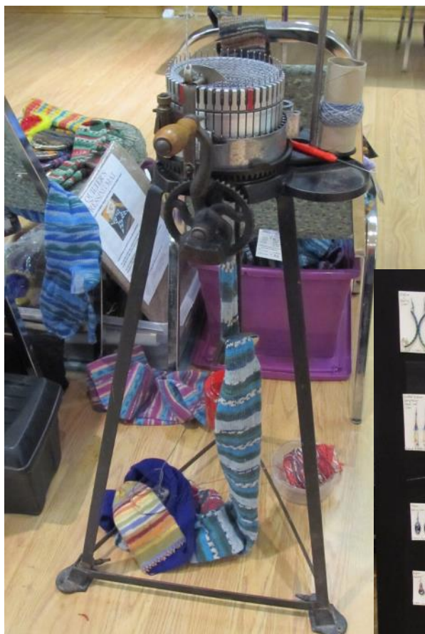
Left : Elspeth King's antique sock knitting machine + socks for sale

A scrap quilt, pieced and/or appliqued, using at least 20 different fabrics; minimum perimeter 200 inches; hand or machine quilted by the entrant or another quilter named on the entry tag; border & backing sample attached. Prize: $10; $8; $6