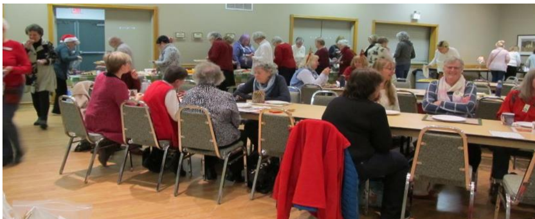
Pot luck social at the December meeting