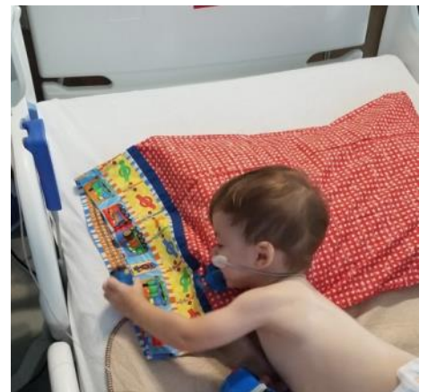
Permission was given to share this photo.

Happy Holidays and Best Wishes for the New Year!