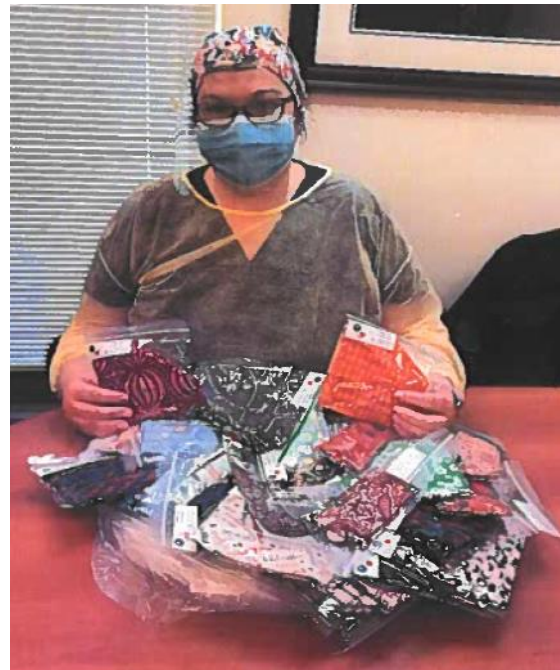
Kits received at Dufferin Oaks

MEMBERSHIP: Guild dues are on hold until September and will be paid by e-transfer or cheque .