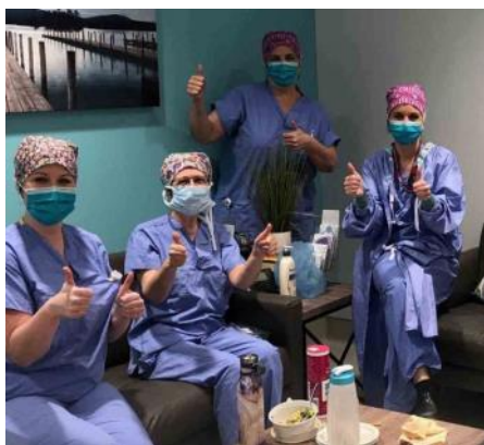
Headwaters Health Care Centre