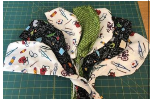
Scrub Caps -838

$1600 collected from donations for masks has gone to the local food banks.