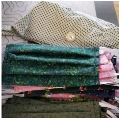
Face Masks/Scrub Caps