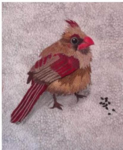
"Guest of Honour"