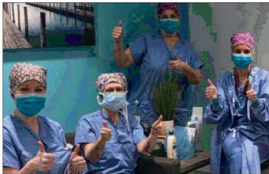
OR staff at break time wearing their new scrub caps. April 7, 2020

And now, some members are responding to Headwaters Health Care Centre's need for scrub caps, head bands and face masks. They have buttons attached so they can hook the elastic over the buttons to protect their ears. Members are also making community masks to help curb the spread of Covid 19.