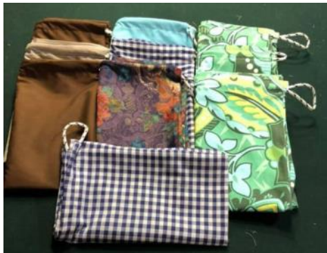
Scrub Bags - 539

$1600 collected from donations for masks has gone to the local food banks.