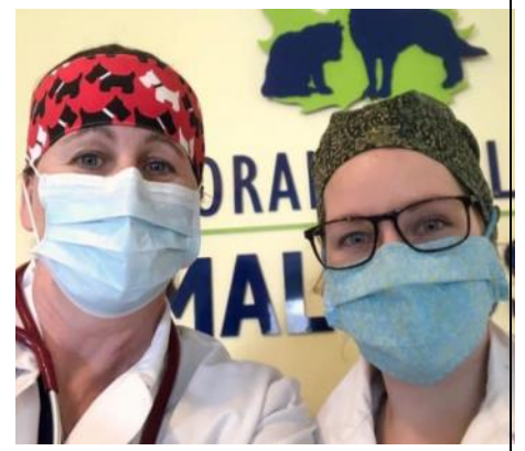
Orangeville Animal Hospital

NEXT ISSUE DEADLINE: Monday, June 01, no later than noon