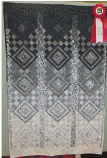
"Always Hope" won 1 st place Viewers' Choice in the pieced category Northcott Challengein at the Guild's 2019 Quilt Show.

"Always Hope", "Guest of Honour" and "Blue Heron Boogie" which won first place for the "Best use of Embroidery".