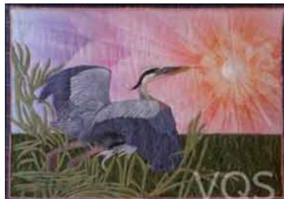
"Blue Heron Boogie" 1 st place for Best use of Embroidery the Virtual Quilt Show April 27 th - May 3 rd .2020