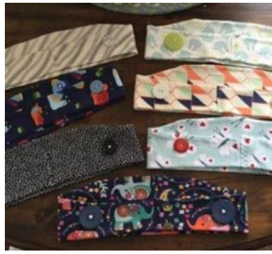
Headbands - 503 Ear saver - 165