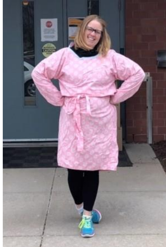
Modelling a gown at FTP (Family Transition Place)