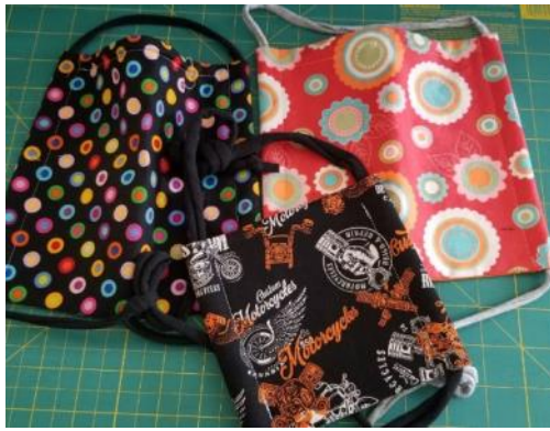
Face Masks - 300

Guild members have been working from their stash, sewing and delivering facemasks, scrub caps & bags, headbands and gowns to health care providers, businesses, community groups and individuals in the area. Thank you to everyone for your time, skill and materials. Special thanks to individuals from the community and Cobwebs for donations of fabric and finished products. Everyone's generosity is much appreciated by the recipients of these gifts. Many recipients have made cash donations which will be re-directed to the Dufferin Food Banks. For more photos and stories go to the Dufferin Piecemakers Members Group and the Guild's Face Book page. Totals as of May 10 th are listed below.