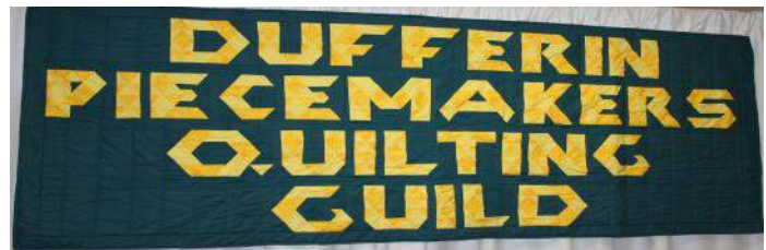
The new pieced show banner created by the members of the lobby committee