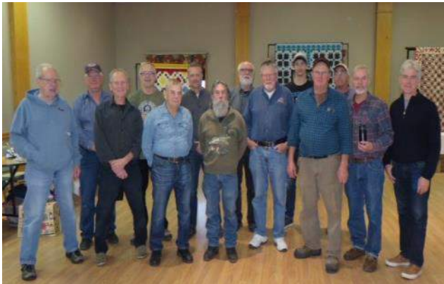
Thanks to the husbands who helped with set up.

Many thanks to all those members who submitted quilts and to the many members who volunteered their time over the two days of the show, and the set up day.