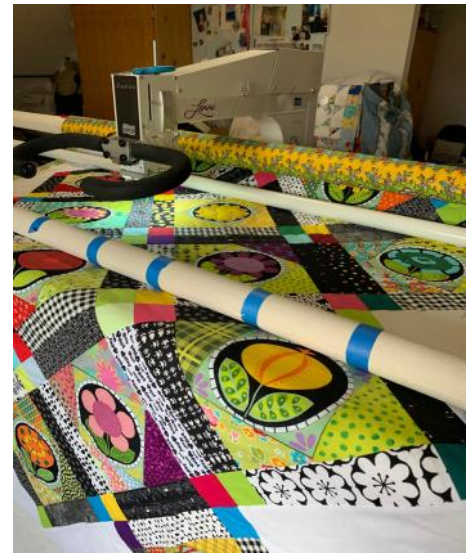
Top donated by Sue HVZ

If you have been cleaning up or out your fabric stashes, they are accepting donations on Connie's front porch. Call or text Connie 519-939-8783 or Penny 519-217-2935 to let them know you are coming.